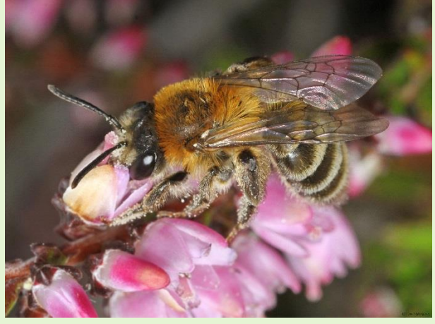
Heather mining bee

3) The wetland area known as Le Canne de Squez which is spanned by a footbridge provides an important wetland refuge within the wide expanse of otherwise dry heathland. This habitat is dominated by Purple Moor-Grass which grows in large dense tussocks which used to be cut at the base and used as stools. Although they are no longer used as stools, some tussocks are still removed to create and maintain open pools.