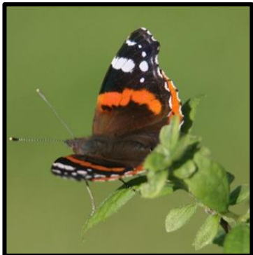
Butterflies and moths