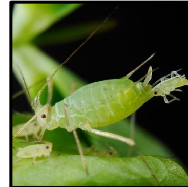
Small insects (less than 3mm)